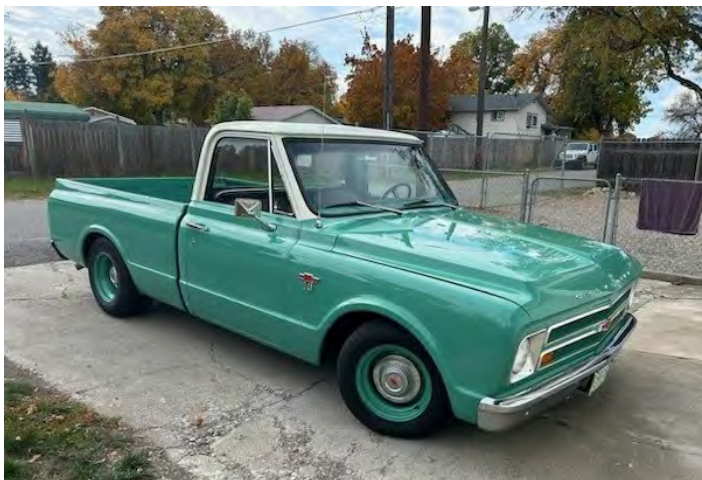
1967 C10 Chevy Pickup