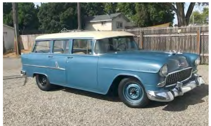
55 Chevy 210 Wagon