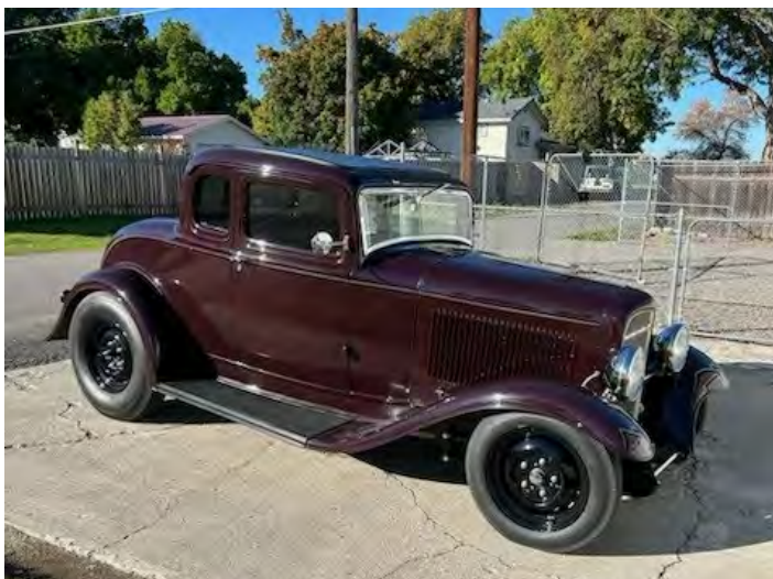
32 Ford 5 Window