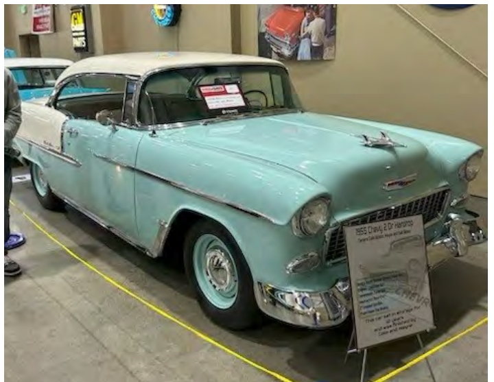
55 Chevy Hardtop