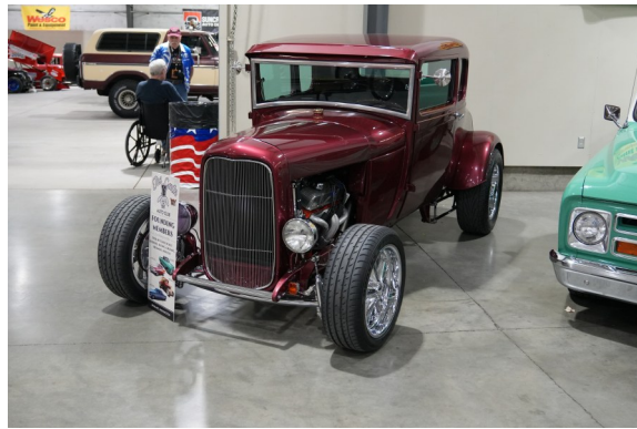
Lon Hansen 1929 Ford Model A five window coupe