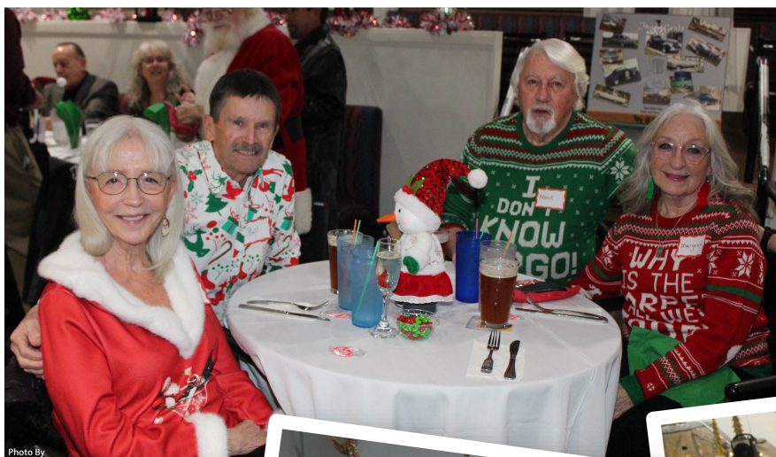
Gents Christmas Banquet, December 13, 2019

On Friday, December 13 Darcy's was filled with smiling faces as the club gathered to once again enjoy their annual Christmas Party. Dressed in their festive wear many showed up to enjoy fellowship with each other as well as a wonderful meal. The decorations added to the enjoyment and helped to put everyone in a holiday mood.