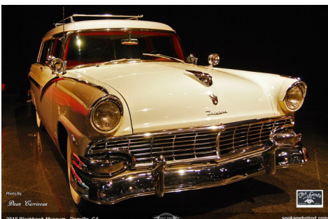
Top of the line 1956 Ford Parklane two-door station wagon with every available option

The mix of cars is eclectic. Cars on display during our visit ranged from an 1886 Benz Motorwagen to dazzling examples of full on classics, nifty-fifty Chevrolets, flavorful Fords, and vintage foreign exotics I have never before seen. You can view real Auburn Boat tail