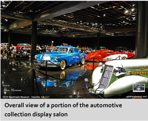
Overall view of a portion of the automotive collection display salon

Janice Gee and I recently had the pleasure of visiting the sprawling Blackhawk Museums located in Danville, California. The northern California museum is mid-point between San Jose and Oakland in the east Contra Costa. Featured at the museums are rotating displays of Native American History, the old west, China, and Art out of Africa, to name just a few. The Blackhawk often schedules