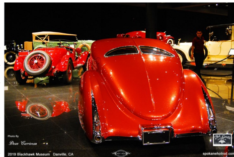
Another angle view from the display salon

prominent speakers on their many changing subjects as well as informative “how to” do