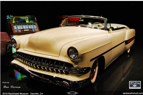
Custom Hot Rod 1954 Chevrolet convertible and Seeburg M200C jukebox in the background

All cars were carefully restored to a high degree and fairly glowed under the subdued lighting of their main display areas.