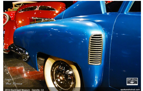
Air cooling vents for the Tucker

the road whenever the car turned, seat belts, a pop out windshield, and a modified Franklin flat six, fuel injected rear mounted helicopter engine. The rear engine placement allowed the Tucker's floors to be flat with no transmission or drive shaft "hump".