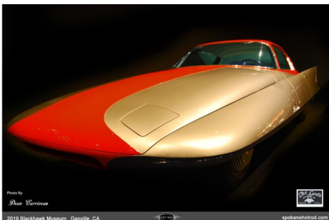
I believe this to be a GM dream concept car ca. 1962

All cars were carefully restored to a high degree and fairly glowed under the subdued lighting of their main display areas.