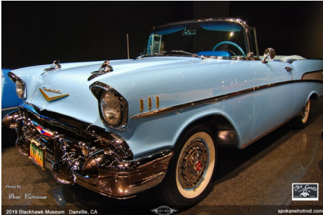
Iconic 1957 Chevrolet Bel Air in Larkspur Blue

Speedsters, a rare Delahaye cabriolet, and eye popping Cords, Cadillacs, and even a 1973 Datsun 240Z. The museum owns many of the cars outright while others are on loan so the displayed cars change regularly.