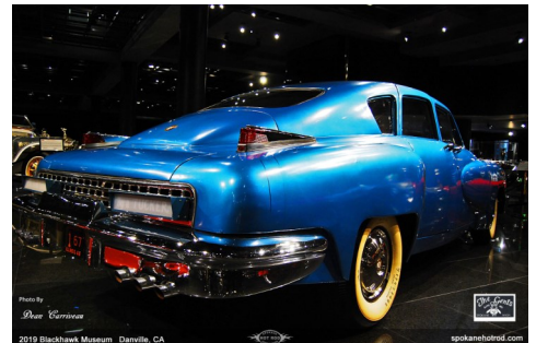
Dealer installed promo light up enunciators proclaiming, "You've been Passed by a Tucker"

The car would top out doing 120 MPH and look mighty fine as it passed, its dealer installed and lighted enunciator reading: "You been Passed by a Tucker".