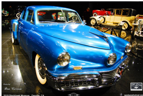
1948 Tucker 48

With only 51 examples produced, the Tucker 48 is now highly coveted and considered one of the most rare collector cars today. Celebrity owners have included