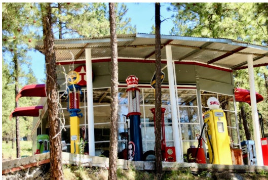
Front of the station