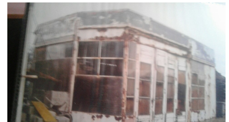
Service Station before removal