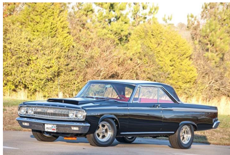
1965-dodge-coronet-15