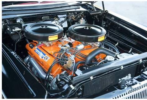
1965-dodge-coronet-7